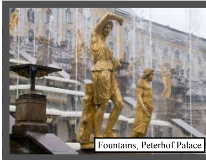
Fountains, Peterhof Palace