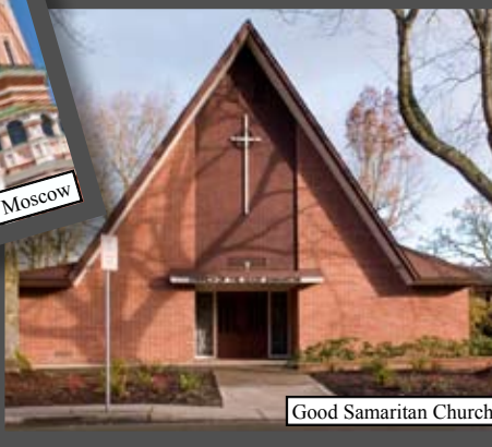
Good Samaritan Church