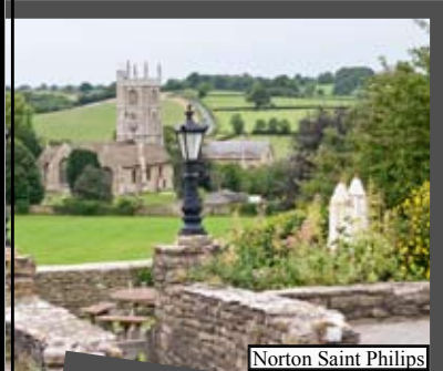
Norton Saint Philips

There is a lot going on at Good Samaritan during the summer vacations.