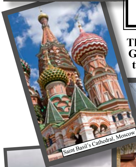
Saint Basil's Cathedral, Moscow