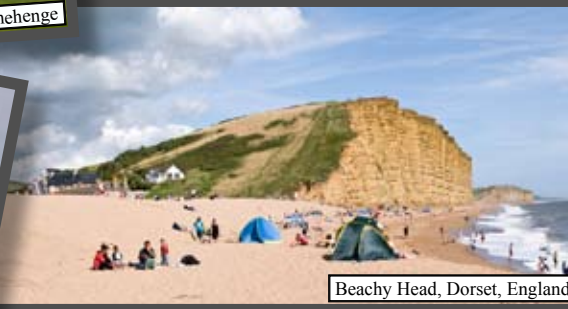
Beachy Head, Dorset, England