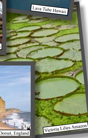
Victoria Lilies Amazon